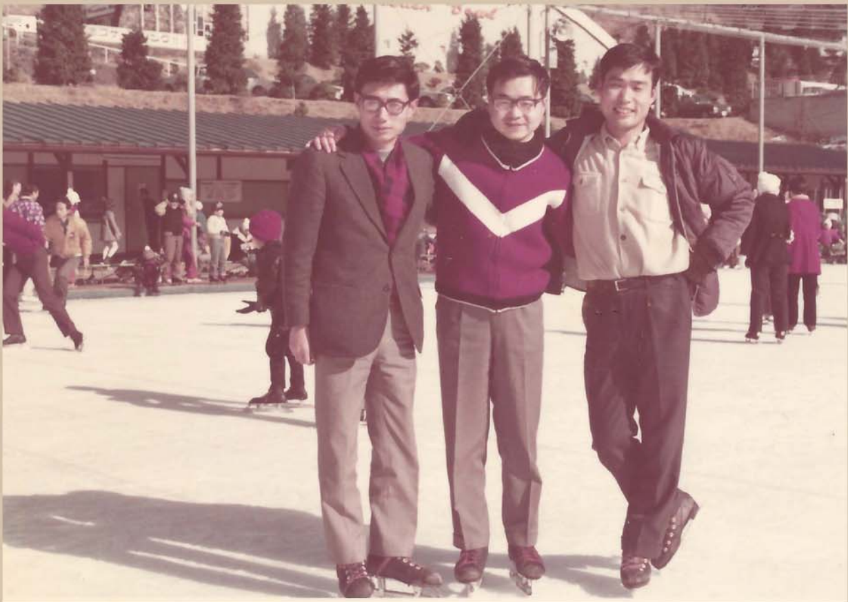
A snap shot at Company Trip - 1962