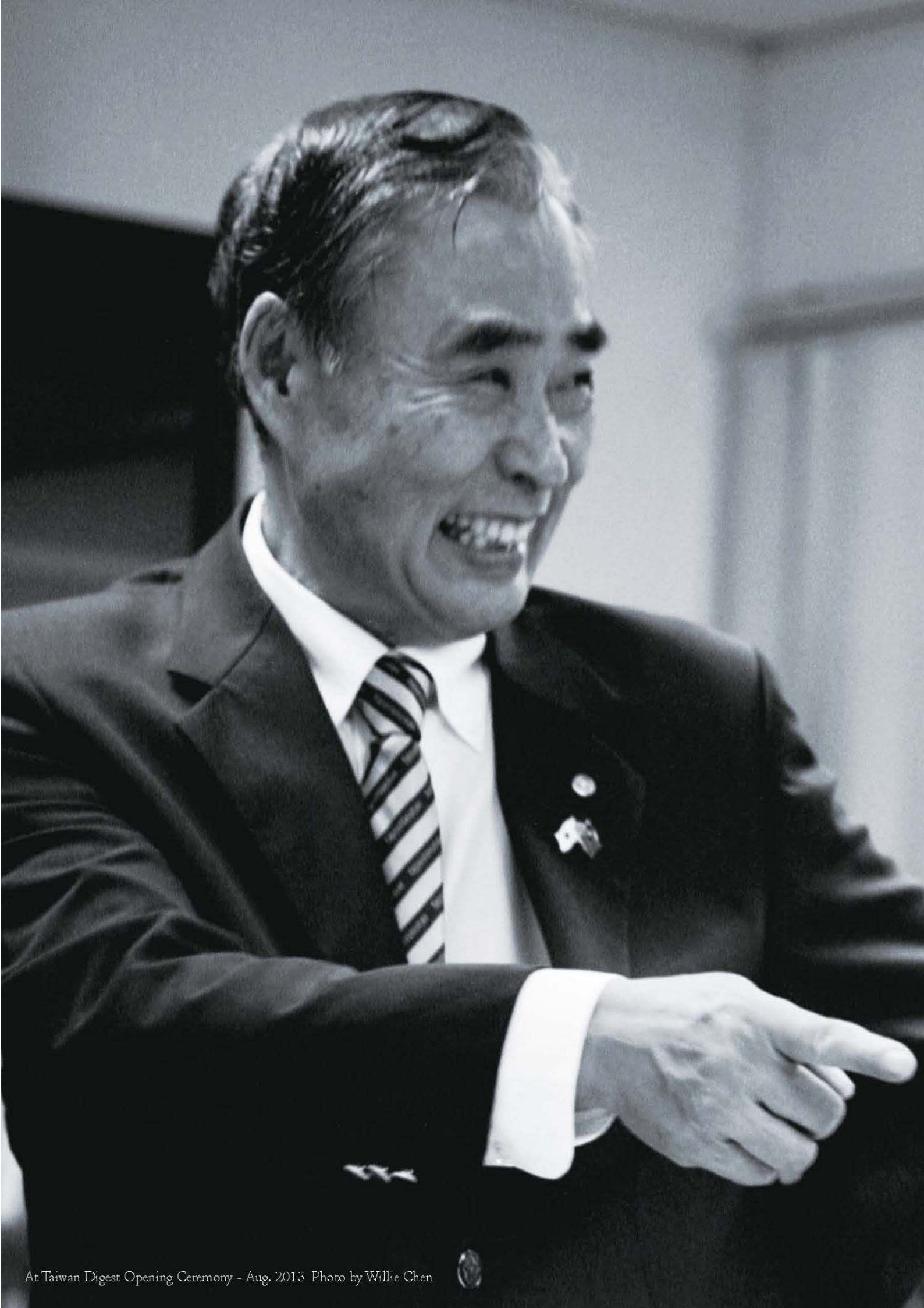
At Taiwan Digest Opening Ceremony - Aug. 2013