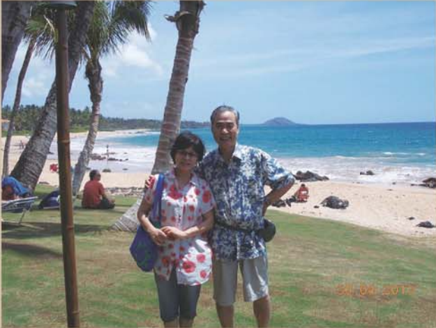
(Below) At the location where his first career in Taiwan begun - 2014