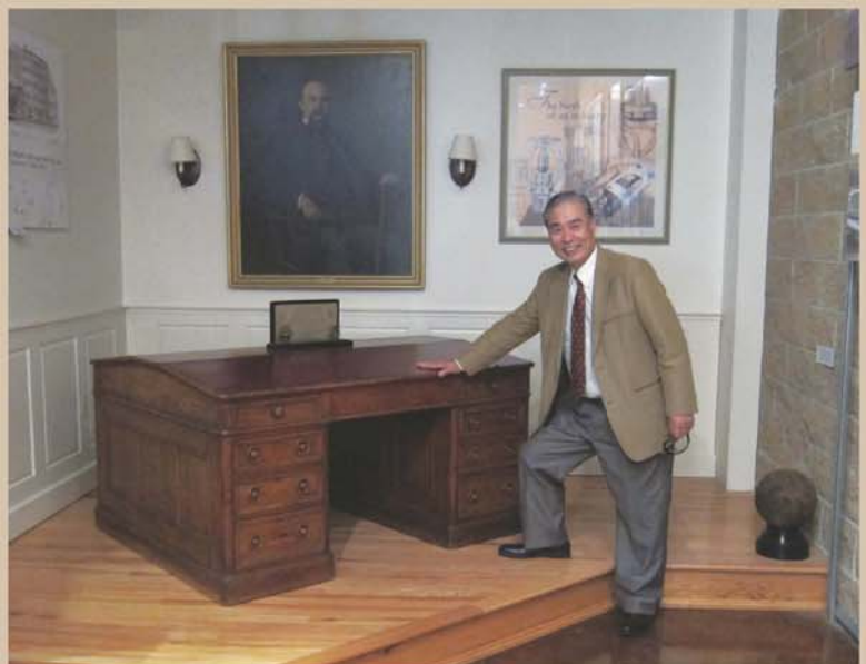
(Right) Touching the table of Frederick Grinnell at Grinnell museum in the Tyco Engineering lab in Cranston RI. 2012.