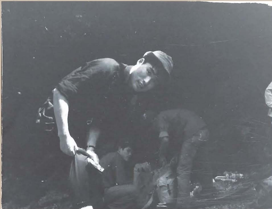
(Above) At Mountain Climbing 1960