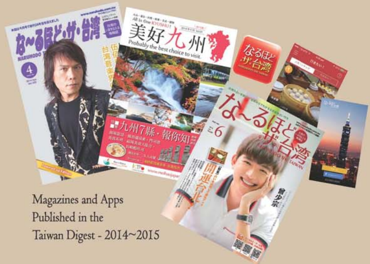
Magazines and Apps Published in the Taiwan Digest - 2014~2015