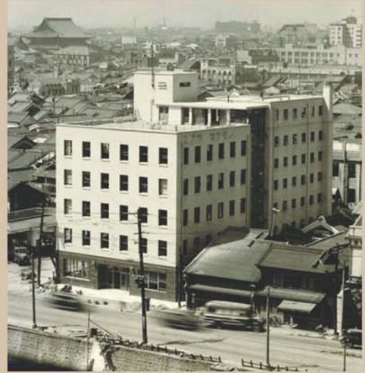
Yuasa Trading Company Osaka Branch. around 1960.