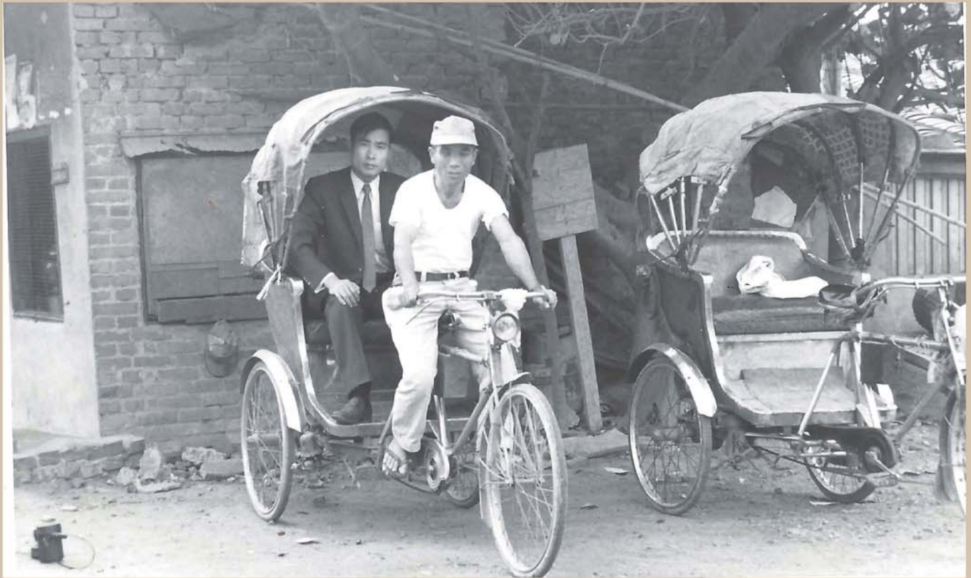
(Above) Riding on a traditional Taxi in Taiwan. 1970